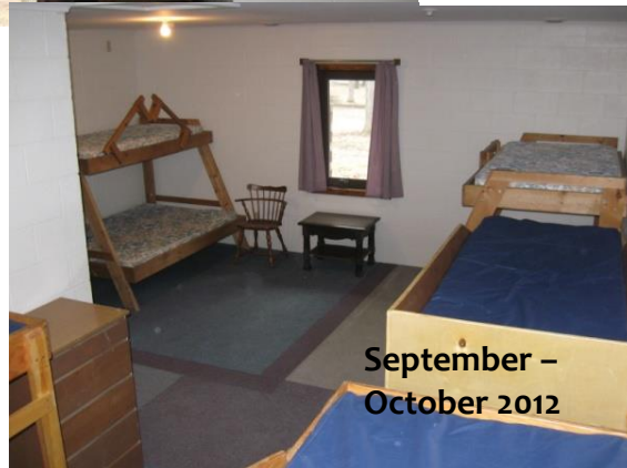
September - October 2012

In September, demolition and reconstruction began to make permanent repairs to roof, ceiling and walls.