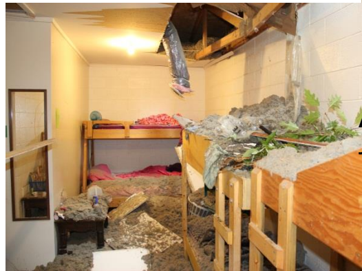
After the storm... June 29, 2012