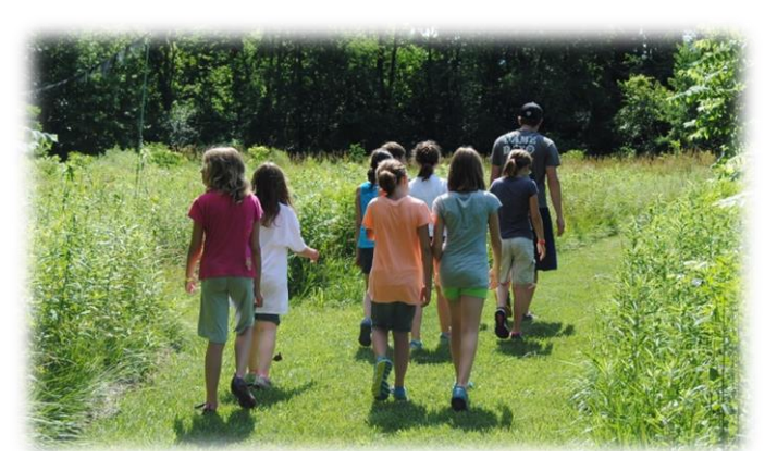
"In him lie hidden all the treasures of wisdom and knowledge." Colossians 2:3

Non-Profit Organization U.S. Postage PAID Columbia City, IN Permit #306