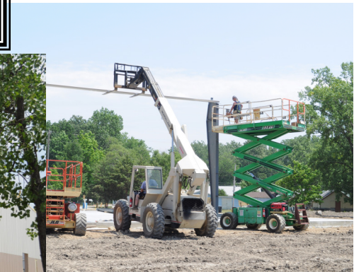
FRAMING & WALLS