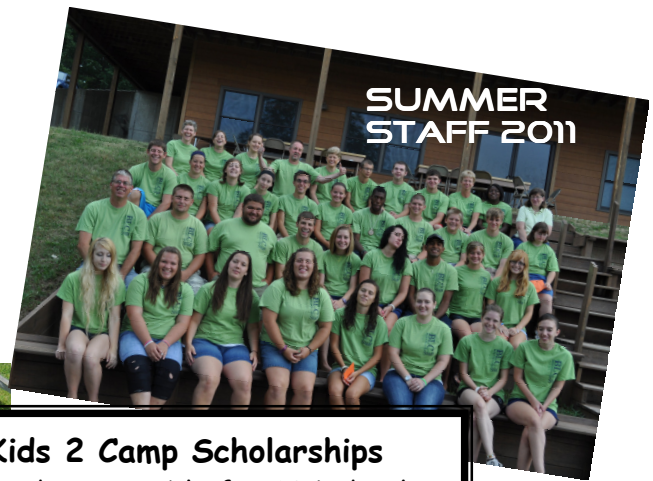
SUMMER STAFF 2011