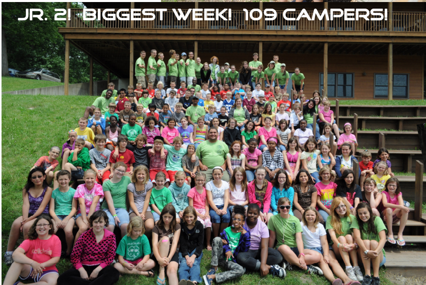
JR. 2! BIGGEST WEEK! 109 CAMPERS!