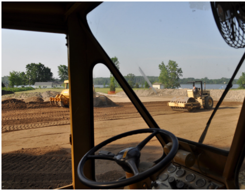
144 TRI AXLE LOADS OF DIRT COMPACTED

"Your road led through the Red Sea, your pathway through the mighty waters - a pathway no one knew was there!! You led your people along that road like a flock of sheep." Ps. 77: 19-20