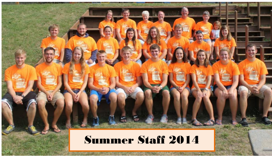
Summer Staff 2014