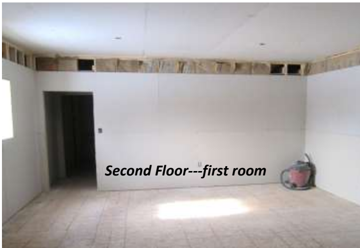
Second Floor---first room