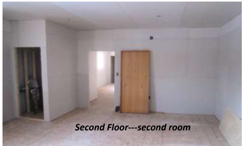
Second Floor---second room

Call the office for more information about the work that will be done on those days.